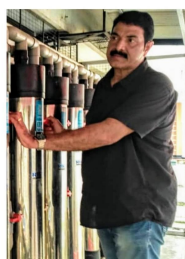
RICHU'S WATER FILTER ST.FRANCIS CHURCH ANUGRAMA NGURURUM ,KOCHI 1 LAKH LTR /day WATER TREATMENT PLANT .2016