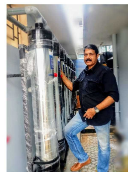
RICHU'S WATER FILTER Little Flower Engineering Institute ,Kalamassery 50,000Ltr /day Water Treatment Plant Installed in 2019