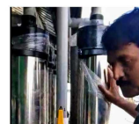
RICHU'S WATER FILTER NAVYA BAKERS 50,000Ltr /day WATER TREATMENT PLANT JAN-2020