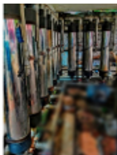
RICHU'S WATER FILTER THE ELECTRICIAN SOUTH PARK ROAD, COCHIN